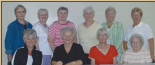
St. Joseph's Auxiliary