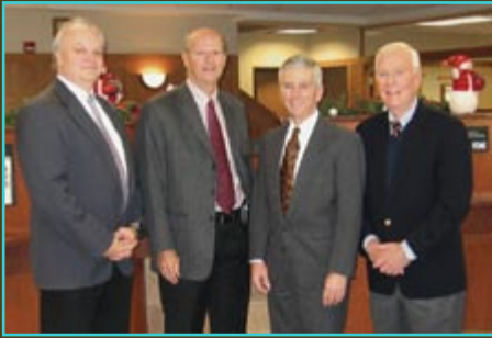
Northwoods Bank of Minnesota

Founders ($50,000 to $99,999) Minnesota Power Northwoods Bank of Minnesota Pine Manor, Inc.