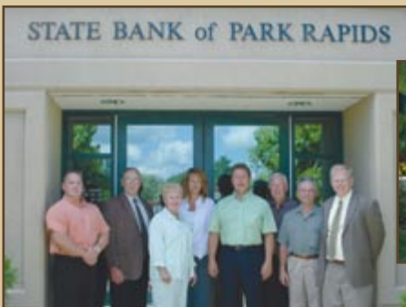
State Bank of Park Rapids