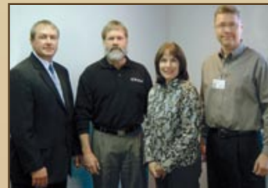
Citizen's National Bank