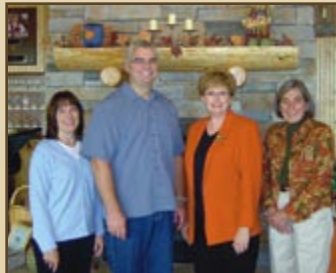
Coldwell Banker Clack & Dennis Real Estate