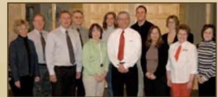
Remax First Choice of Park Rapids