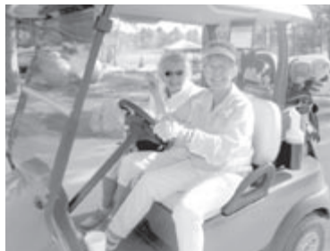
Golfing can be a serious sport for some, for others there is some serious fun to be had when raising money for a good cause.