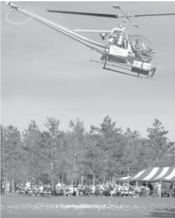
Hard to say which was better, a beautiful day spent out on the links at Blueberry Pines Golf Club or supporting St. Joseph's Hospice and Scholarship Fund. Well, it's not like anyone has to choose. Thanks to all for your generosity.