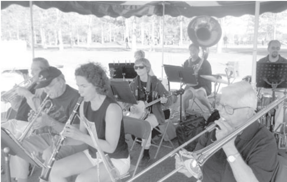
The golf event ends every year on a high note with music from the Upper Mississippi Dixieland Swing Band.